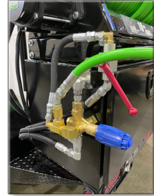
Mounted Flow & Pressure Controls