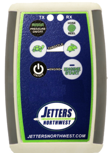
Wireless Remote Control on DWR Models