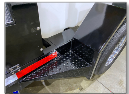
Heavy-Duty 4" x 2" Trailer Frame